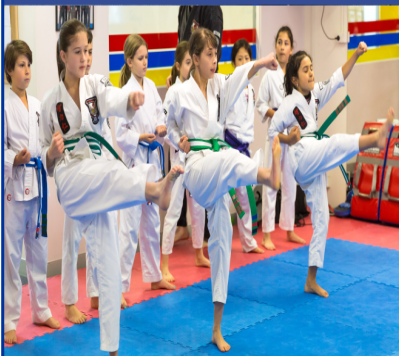
VALUABLE LIFE SKILLS